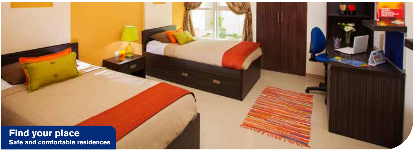
Find your place Safe and comfortable residences