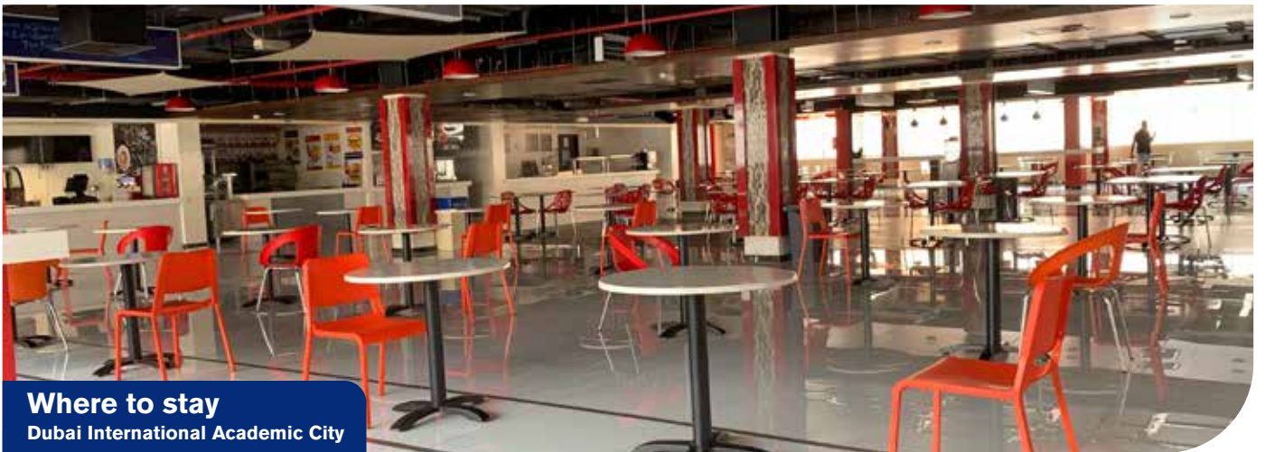
Where to stay Dubai International Academic City