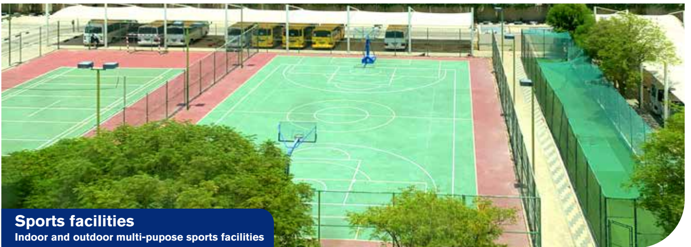
Sports facilities Indoor and outdoor multi-purpose sports facilities